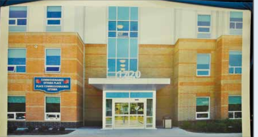
▲ NEW BUILDING NAMED: This rendering shows new signage when Building A is officially designated Commissionaires Ottawa Place / Place Commissionnaires Ottawa.