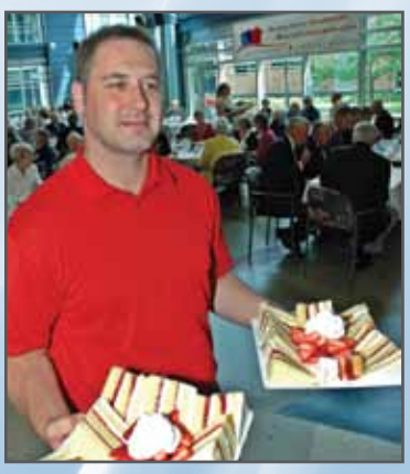
Perley Rideau staff served platters of delicious strawberry shortcake to some 350 celebration guests on June 18.