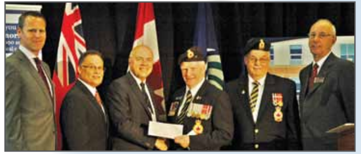
▲ LEGION DONATION: The Perley Rideau Foundation gratefully receives $3,000 from the Royal Canadian Legion Pointe-Gatineau Branch 058 and $3,000 from the Royal Canadian Quebec Provincial Command Service towards the Veterans Priority Needs List.