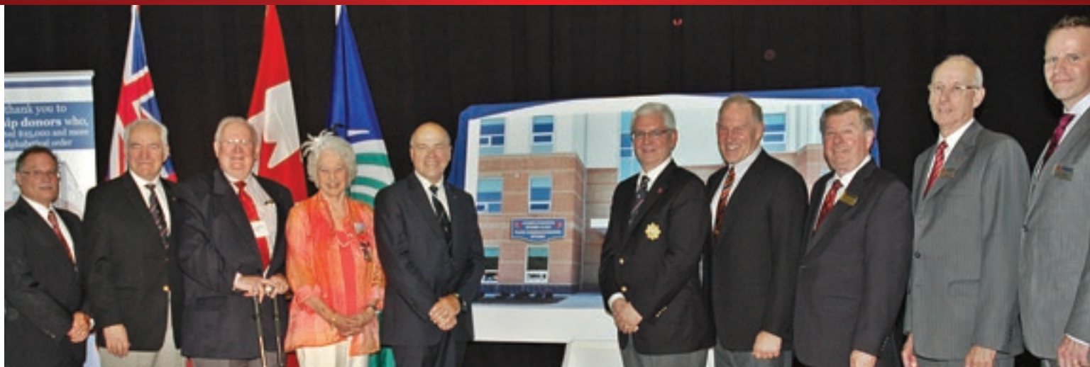
Official naming of Commissionaires Ottawa Place – June 2014