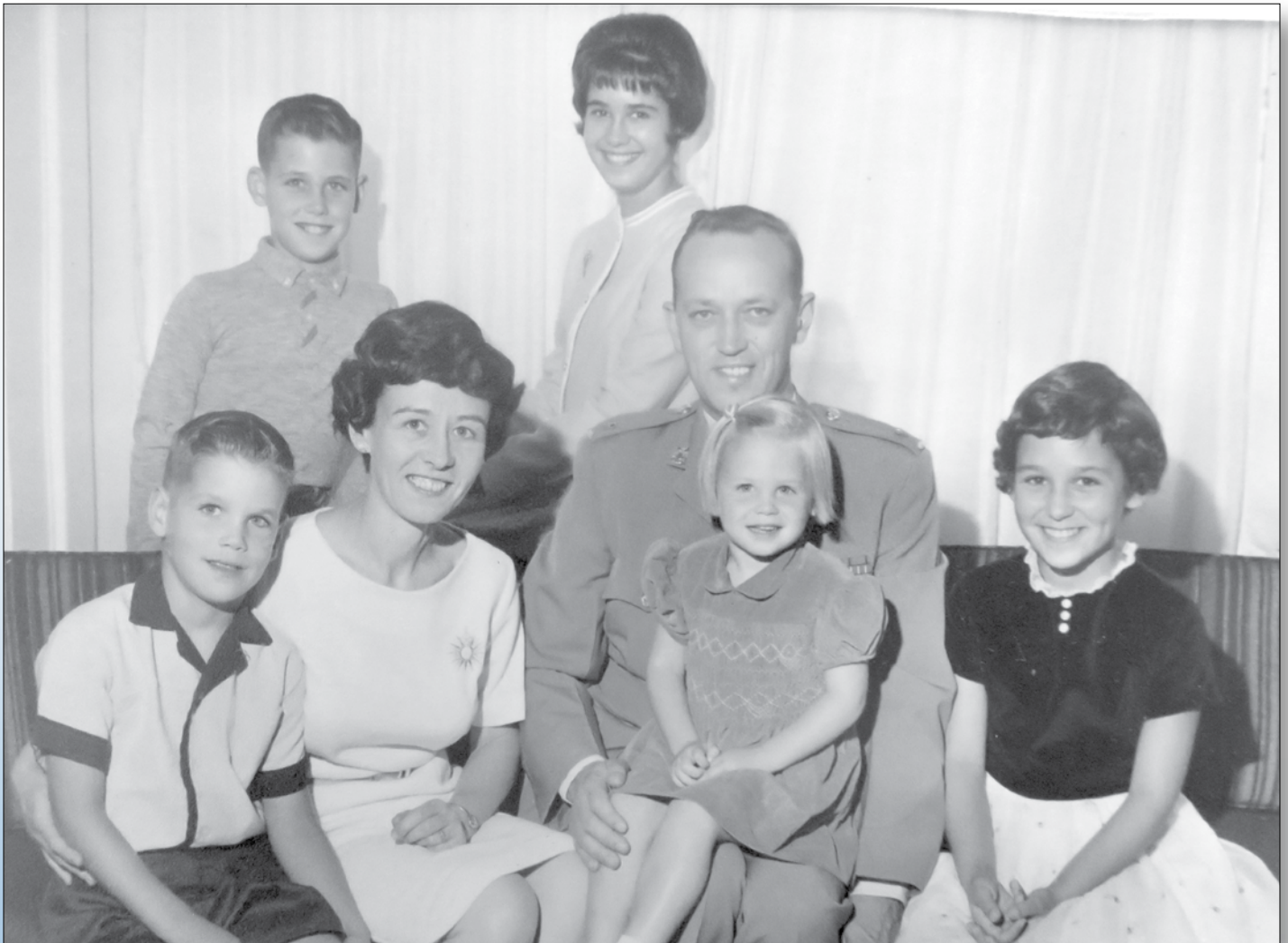
The Commerford family in the mid-1960s.