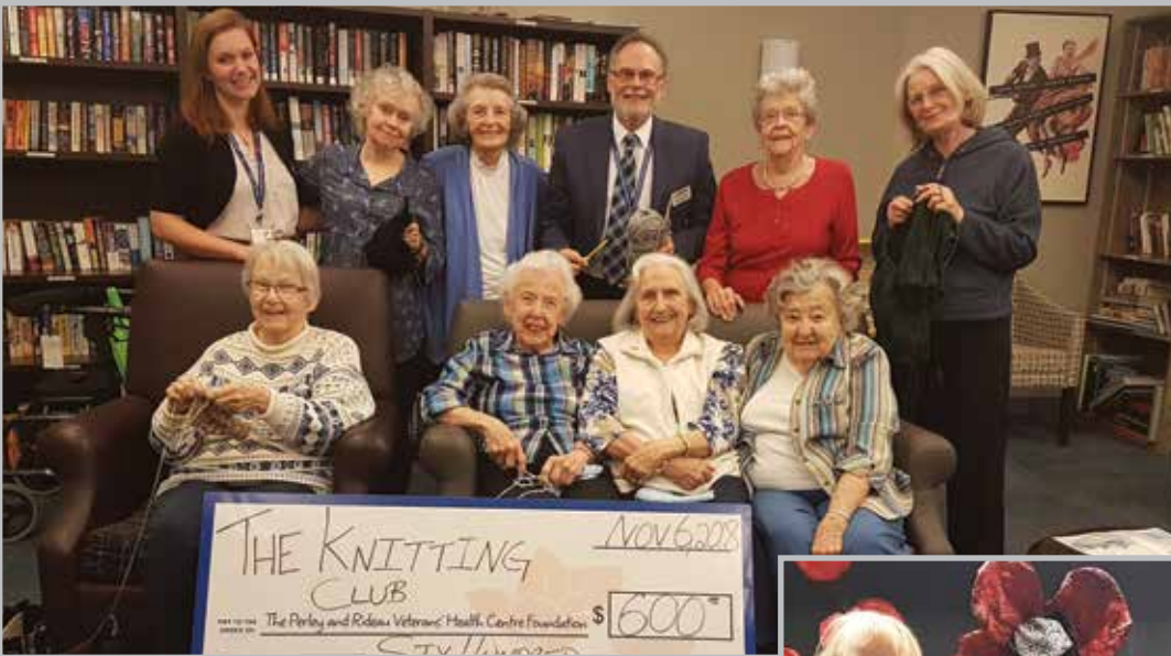
Knitting Club (November 12th) • The ladies of the tenants' Knitting Club, who already enrich the Perley Rideau in so many ways, donated the proceeds of their most recent knitting sale – $600 – to the Foundation! Thank you all for your hard work and caring attitude!