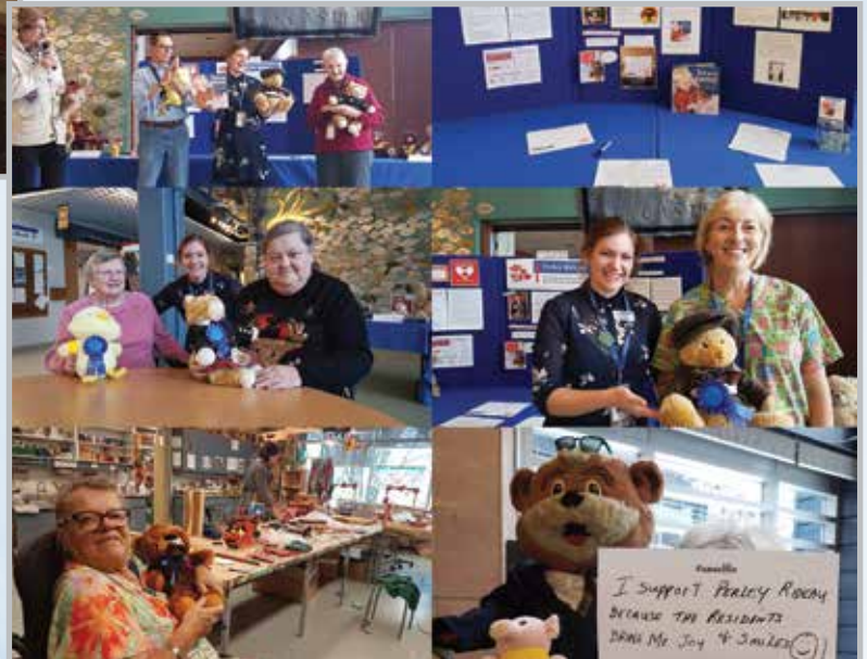
Giving Tuesday/Teddy Tuesday (November 27th) • Thank you to everyone who participated in the first ever #TeddyTuesday celebration of #GivingTuesday! Over $3,000 was raised to support resident comfort, care, and services at the Perley Rideau. This is a fantastic feat and proof of the generosity of the Perley Rideau community! Teddy will be back for Giving Tuesday, November 26, 2019.