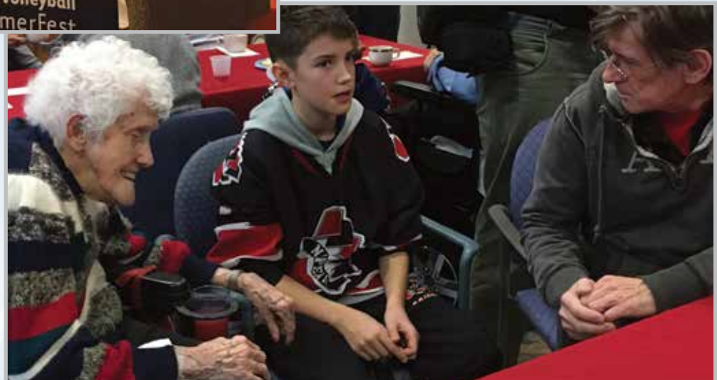
▶ On December 9th, members of the Nepean Kings peewee hockey team visited the Perley Rideau, sharing their favourite books and tasty Christmas goodies, and collecting the autographs of Veterans on the mini-sticks they brought! As part of their participation in the Good Deeds Cup, the Kings give back to the community by visiting seniors and Veterans, and by learning about the men and women who fought to protect our way of life. In addition to this visit, the Kings attended a Remembrance Day service and plan to visit the War Museum. Thank you, Nepean Kings, for visiting the Perley Rideau and we look forward to having you back soon!