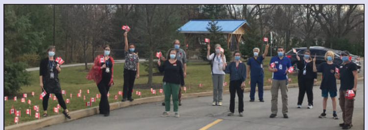
Staff pose with Canadian flags as a thank you to our community for making the tribute possible. Your support planted 819 flags and raised $16,370 for senior and Veterans care.