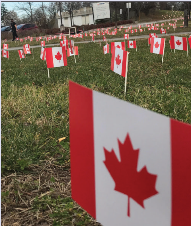
A sea of Canadian flags graced the front lawn of Perley Rideau on November 11, 2020 for Remembrance Day and to mark the 75 th anniversary of the end of the Second World War. This was made possible by you our donors and community members.