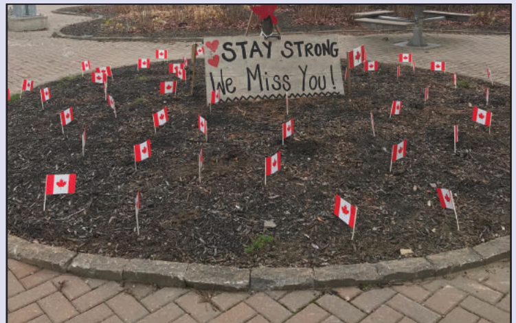
Thank you to everyone who sponsored a flag to honour the brave men and women who served and made sacrifices for our country. You showed the Veterans at Perley Rideau that they aren't forgotten during this year's virtual ceremony.